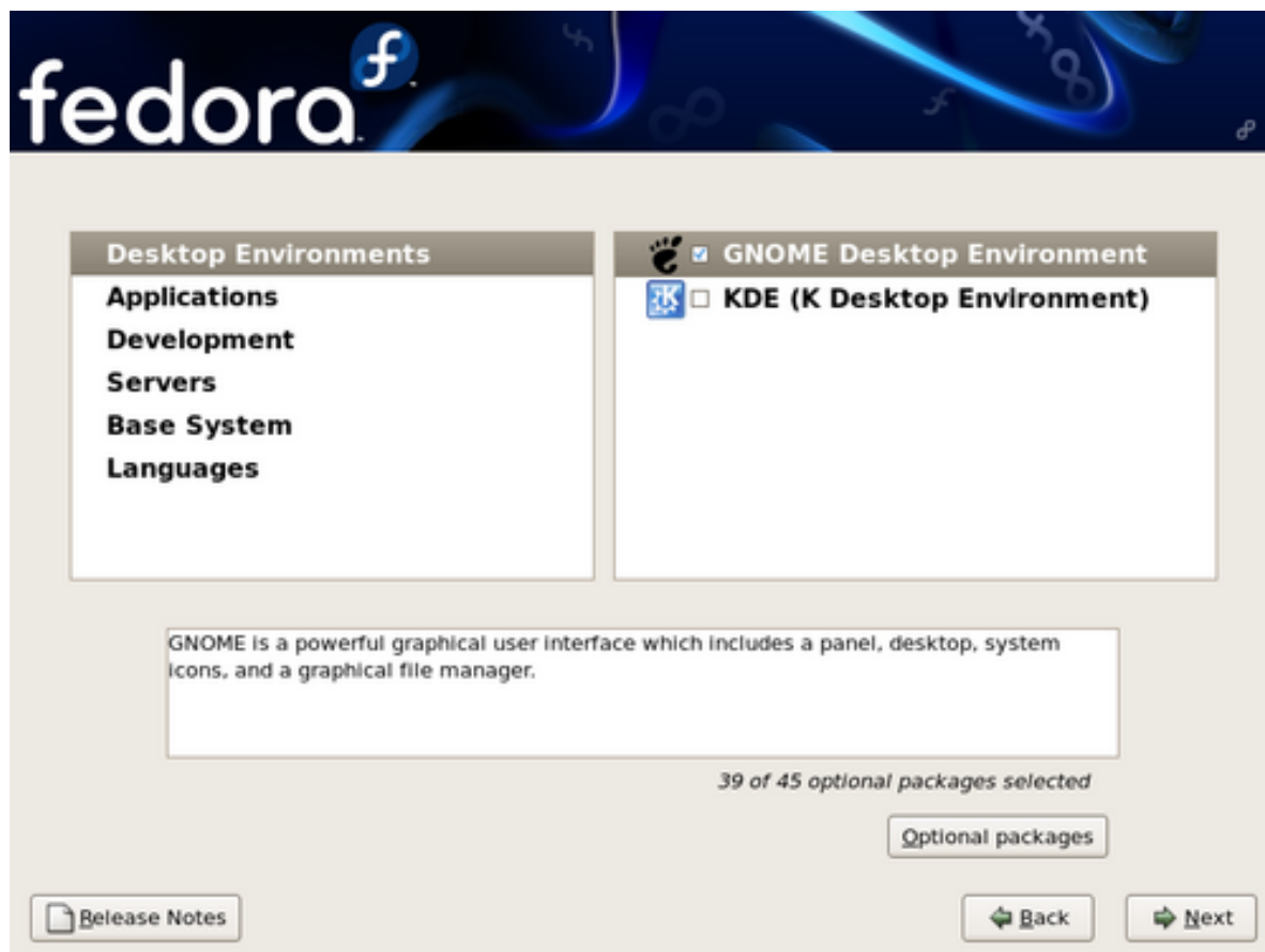
Figure 14.1. Package Group Selection Screen

To view the package groups for a category, select the category from the list on the left. The list on the right displays the package groups for the currently selected category.